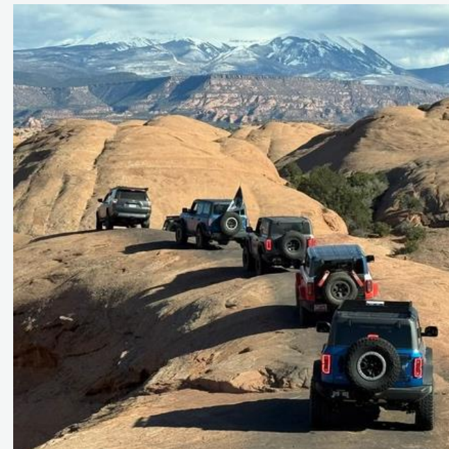
Outdoor Enthusiast & Technophile