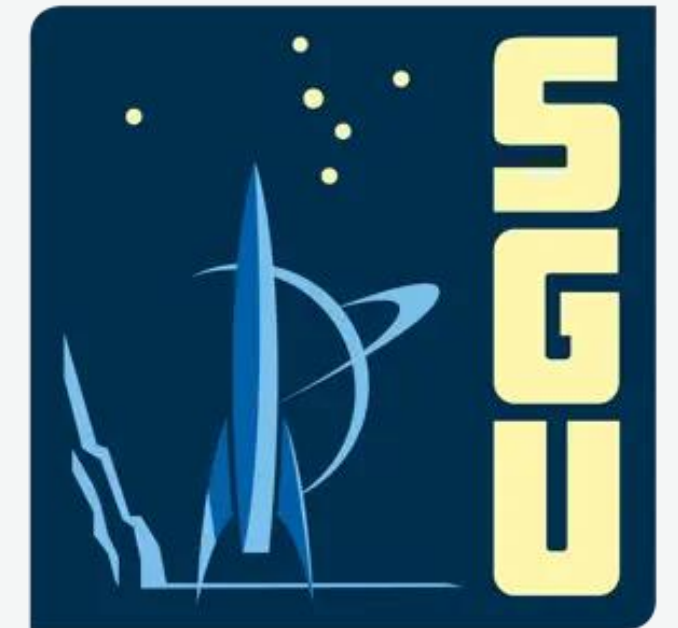
Science & Technology